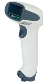
Honeywell Xenon Scan Pattern

Honeywell Xenon 1902h is designed with healthcare plastics (disinfectant-ready). Kit includes imager, base/charging station, USB cable and system configuration sheet.