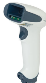
Honeywell Xenon Scan Pattern

Honeywell Xenon 1900g is designed with healthcare plastics (disinfectant-ready). Kit includes imager, USB cable and system configuration sheet.